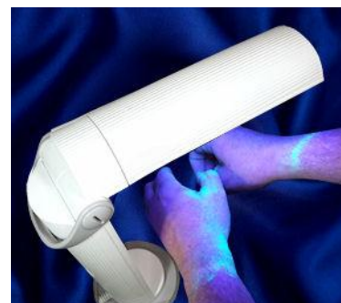
Poor hand washing technique revealed